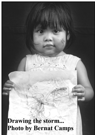
Drawing the storm...